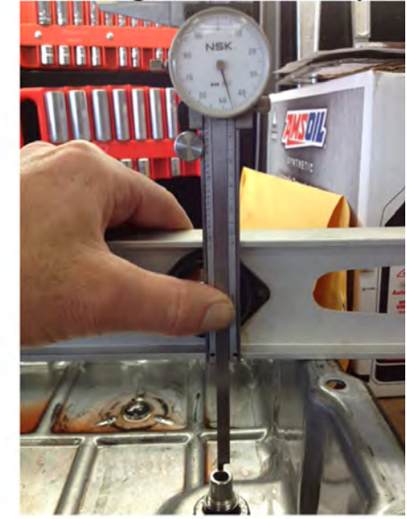
Checking fluid level depth