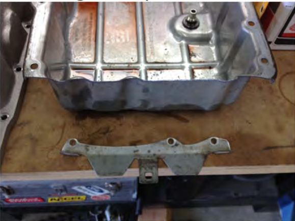
Removing stock pan bracket